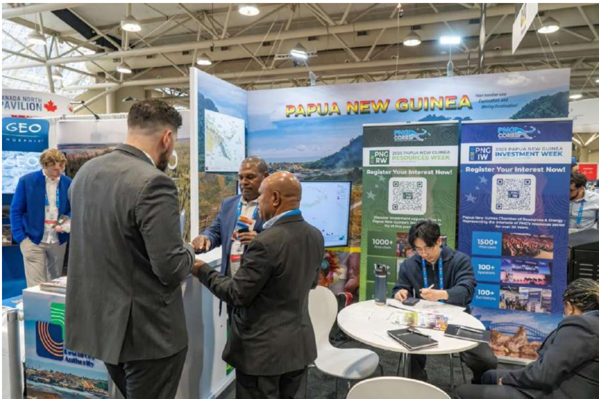
Photo 3: MRA technical staff attend to a potential investor during the convention