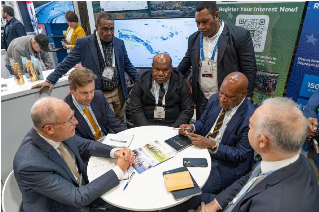
Photo 2: Minister Goin left discussing potential collaboration with World Bank officials during the convention.