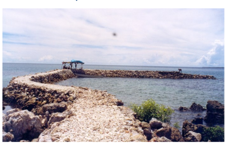
Coastal Zone development