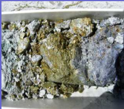
Ore in Context

Information available include all geo-science data, information, explora- tion and mining license areas in PNG.