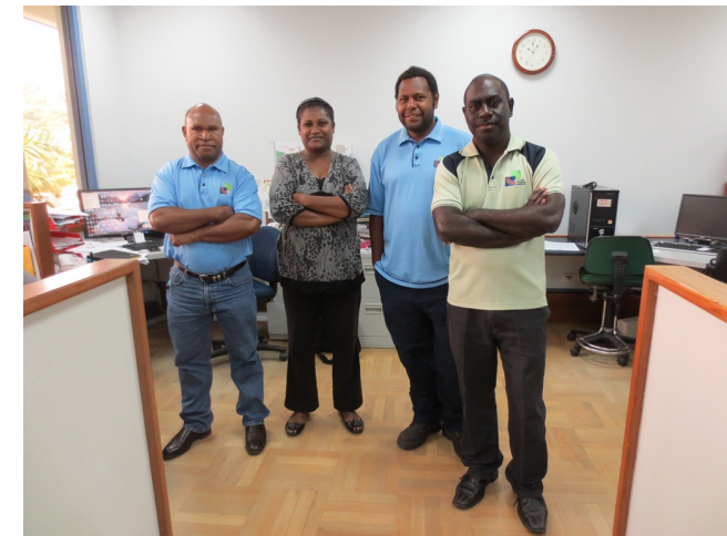
The IMD Team