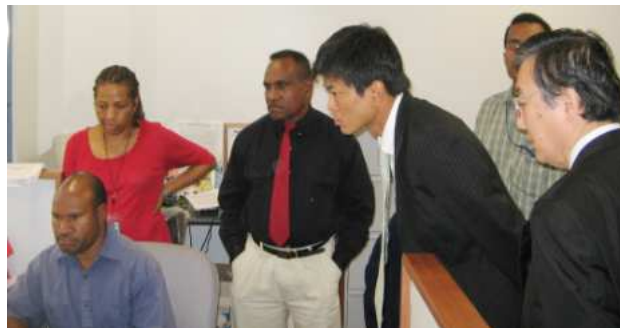
Information and Marketing officers attending to Korean clients interested in investing in PNG's mining sector.

These metadata from the datasets are significant, as they may indicate general mineralization processes in the surveyed areas.