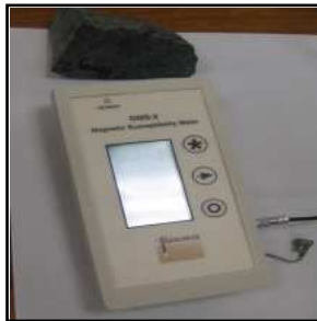
Magnetic susceptibility meter

The branch has field equipment for different purposes and uses Geosoft Oasis Montaj for data processing and interpretation. Field operations are arranged upon client request or where it is relevant to acquire data for updating of the geophysical database.