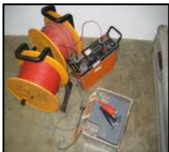
Some components of electrical resistivity surveying equipment.